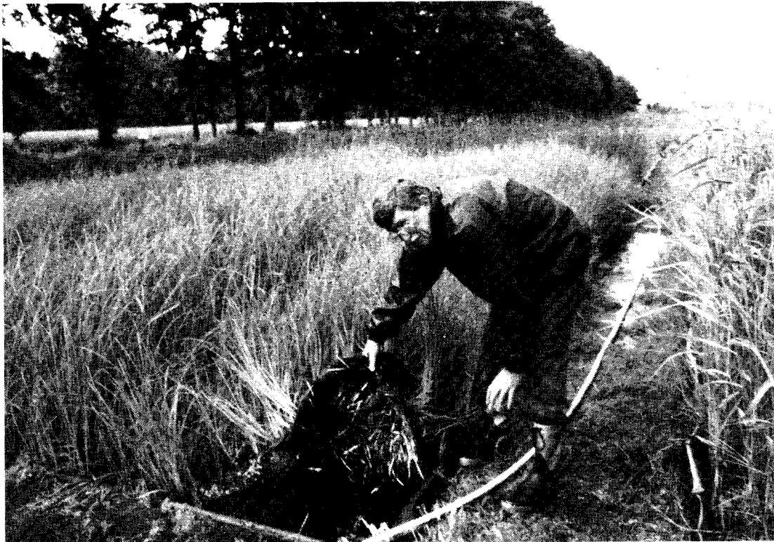
Figure 3. The substrate laid as pallets