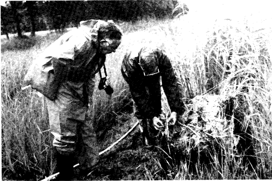
Figure 2. The substrate laid as carpet