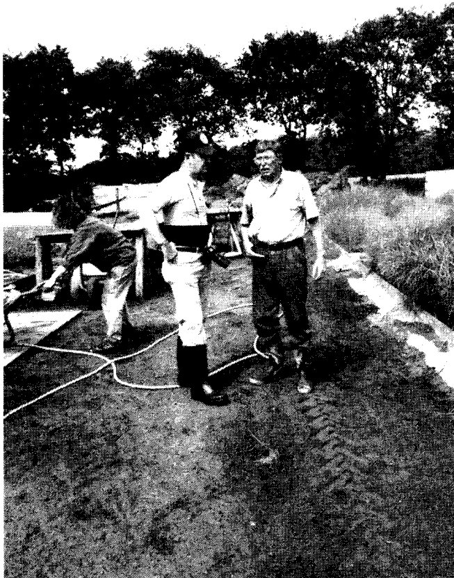
Figure 1. Plants transferred to shallow-water flats

Because of these advantages, such propagation methods lend themselves to areas where rapid and almost immediate wetland development is desired, such as in erosive environments along streambanks and lake shorelines.